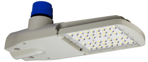
Pallas 2 75-110W